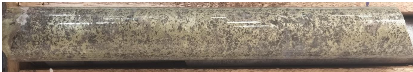
Figure 1: Interpreted breccia copper sulphide mineralization in DDH2405T012 at T5 (158.90m - 159.10m downhole), on the eastern most extent of drilling.

Type: FR = Fresh Rock. Recovery methods and results will differ based on the type of mineralization.