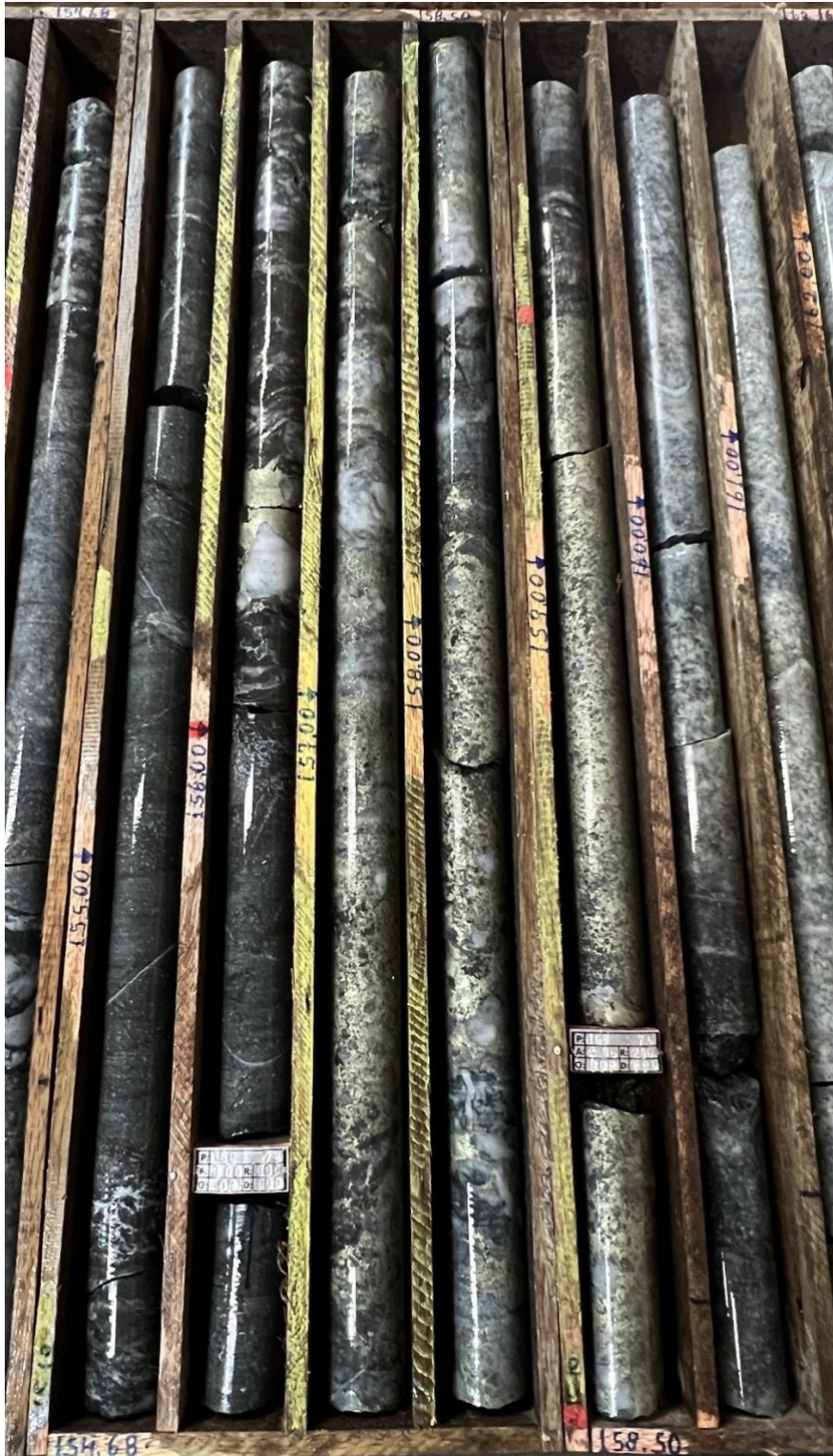
Figure 3: Semi-massive and breccia copper sulphides in DH2405T012 (154.68 – 161.25m shown).

DDH2405T006 and 007 are thought to be located too far north to intercept the emerging interpreted mineralized zone, while DDH2405T008 (Figure 4) was drilled to the south of T5. BHEM will also be completed on these holes to detect potential off-hole conductors.