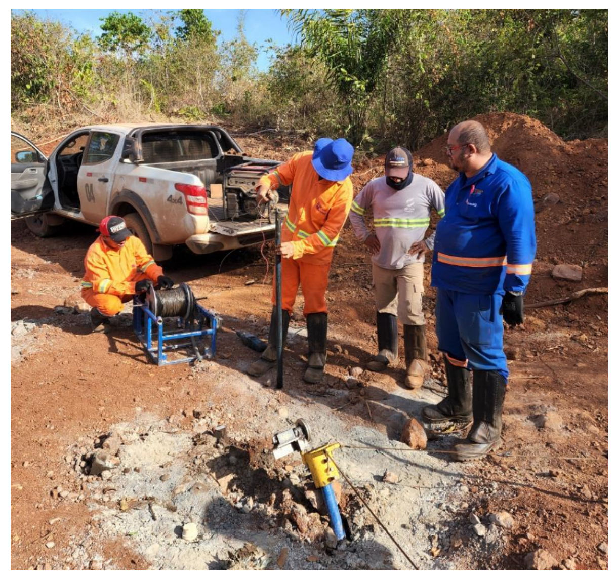
<u>Commencement of DHTEM Surveying at Luanga – DDH22LU049</u>

Phase 1 drilling is primarily designed to confirm, infill, and step out from the previously defined PGM+Au+Ni mineralization in order to increase confidence in the geological model and provide the basis for future mineral resource estimates. Additionally, drilling will target potential extensions to the mineralization at depth and, given the more recent discovery of massive sulphides, evaluate the potential of this new style of mineralization.